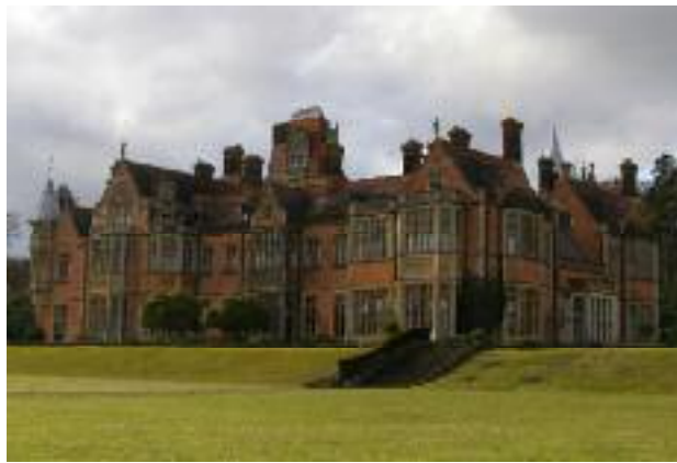
Wyfold Court Mansion