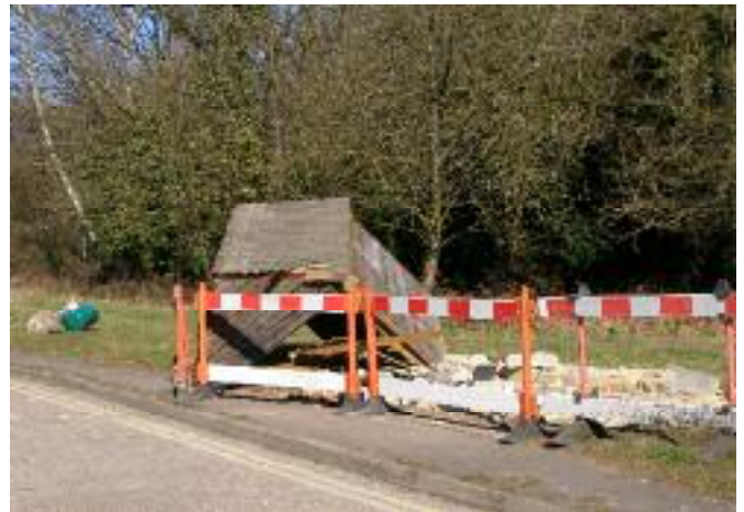
After the Event!

Early on Friday 5th March a car ran into the bus shelter on Stoke Row Road. One person was injured although not seriously; the police did attend. The bus shelter and bus stop sign were certainly left looking the worse for wear.