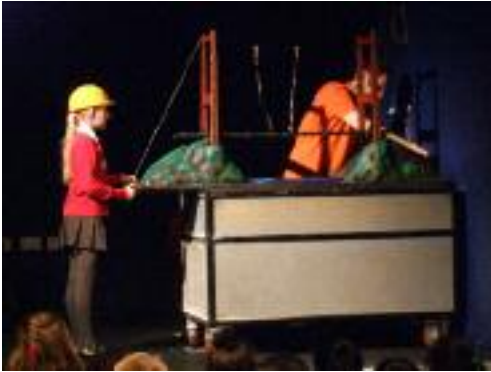
Model Bridge Builder at the Science Museum

A wealth of new extra curricular clubs have kept the children busy. These include Art and Craft Club, Cookery Club and a host of sporting clubs (athletics, football and netball). Latin Club remains a firm favourite with some children.