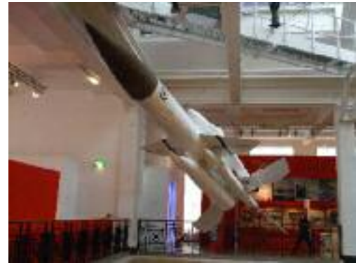
Rocket at the Science Museum

On Tuesday, 9 th February, the whole school paid a very successful visit to the Science Museum in London. The children had great fun and are now back in school continuing their learning about things they saw. One class is even studying female pilots after their comments in the museum that, 'Girls can't be pilots'!