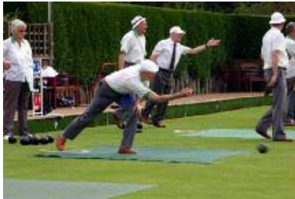
Members of the Peppard Bowls Club in action

The new season is just around the corner and we're looking for new members to join our friendly mixed Club. If you fancy an evening or afternoon out in the fresh air, with a little laughter thrown in, pop in and visit our Club on one, or both, of our Open Days.